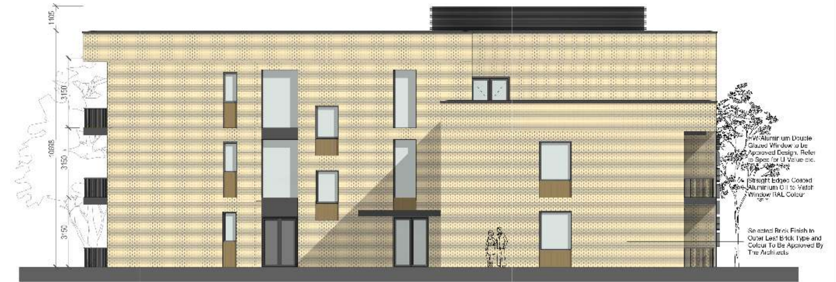
4 Block A - North Elevation 1:100