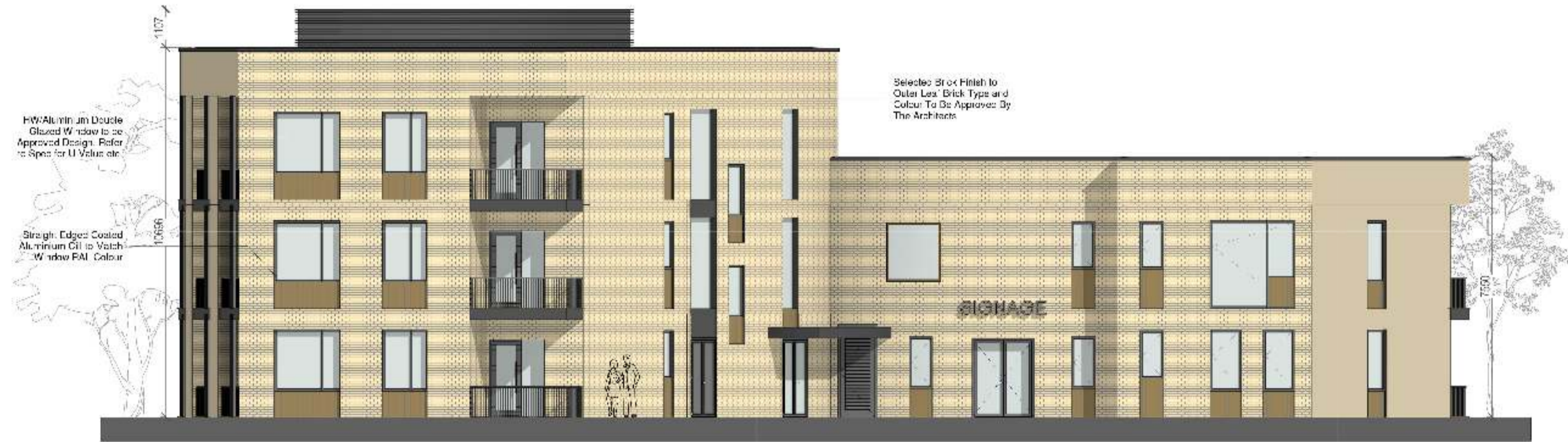
2 Block A - East Elevation 1:100