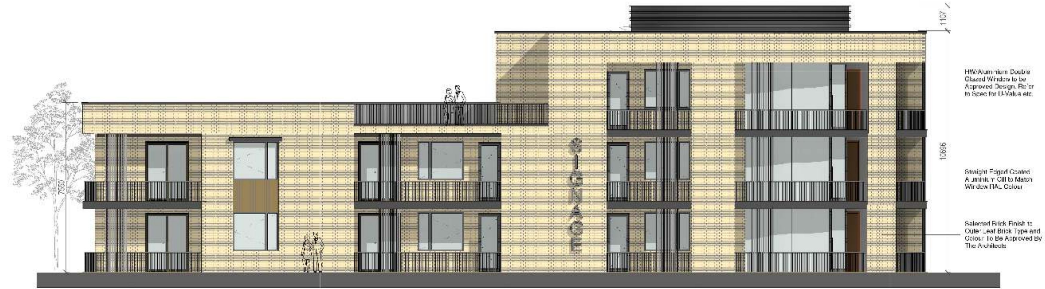
3 Block A - West Elevation 1:100

CPR Note: All works to be carried out using proper materials which are fit for the use they are intended and for the condition in which they are to be used. All materials used in connection with the works to comply with the Construction Products Regulation (EU) No. 305/2011 and the harmonised technical specifications/standards that fall within the remit of the CPR No. 305/2011