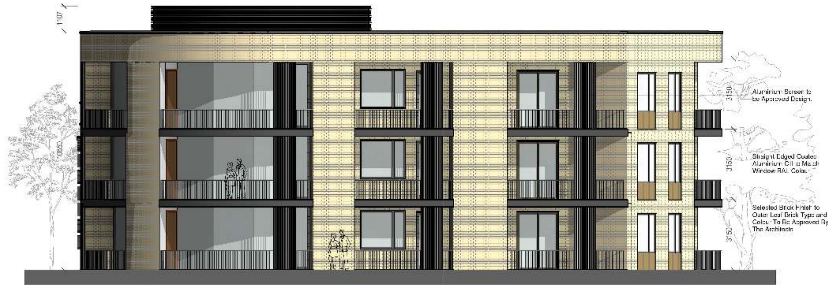
1 Block A - South Elevation 1:100